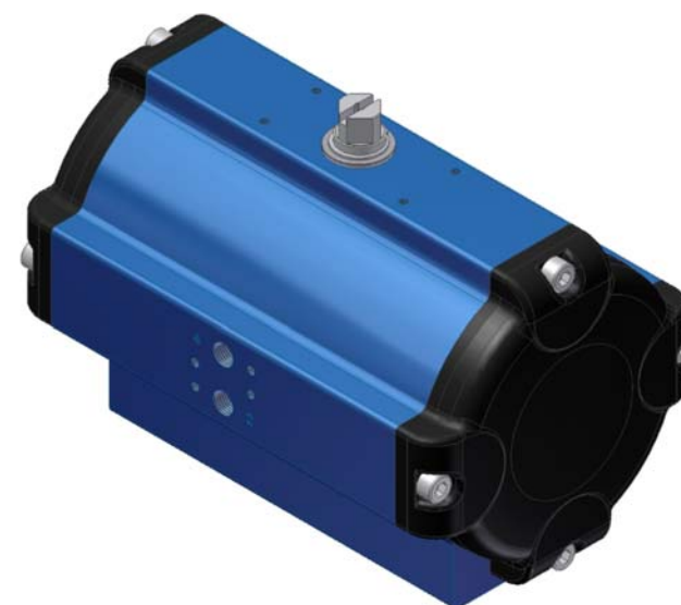
SAD - 135°