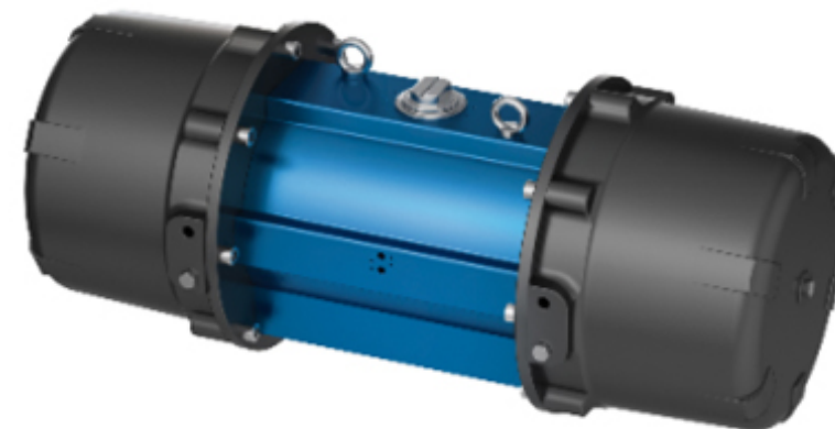
SADT / SADP

AMG-PESCH GmbH Adam-Riese-Straße 1 D - 50996 Cologne Tel.: +49-(0) 22 36 - 89 16 - 0 Fax: +49-(0) 22 36 - 89 16 - 73 E-mail: info@amg-pesch.com www.amg-pesch.com